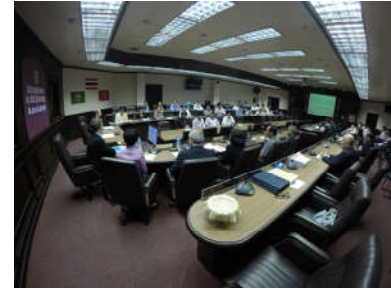
1-month class room teaching, Introductory Course on Field Epidemiology, 2017