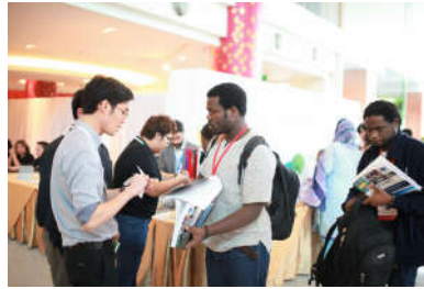
URI quick interview by surveillance team, #TEPHINET Global