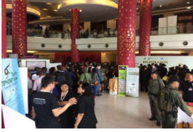
Conducted the Surveillance systems for mass gathering events: the 9th TEPHINET Global Conference, August 2017